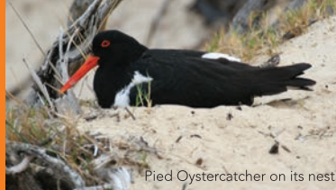
Pied Oystercatcher on its nest

Chicks are incredibly vulnerable – they are tiny, camouflaged and must wander along the beach in search of food. It takes five weeks for them to be old enough to fly out of harm's way. This makes it a great challenge for these birds to raise a family on beaches visited by people and their pets!