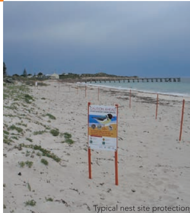
Typical nest site protection

They are in desperate need of a helping hand.