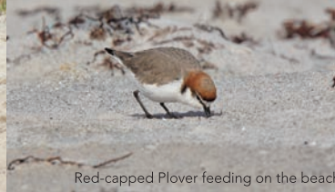
Red-capped Plover feeding on the beach

They are in desperate need of a helping hand.