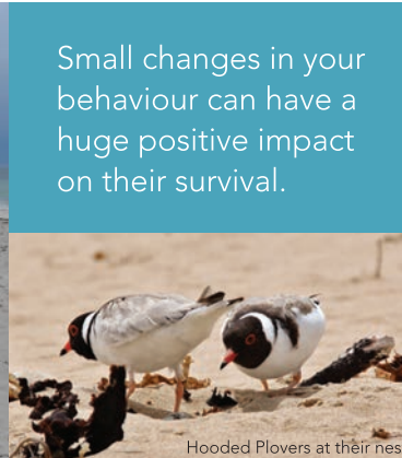
Hooded Plovers at their nest