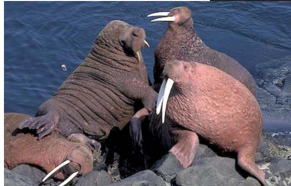
Above: Laptev Sea Walrus Far left: Atlantic Walrus Left: Pacific Walrus