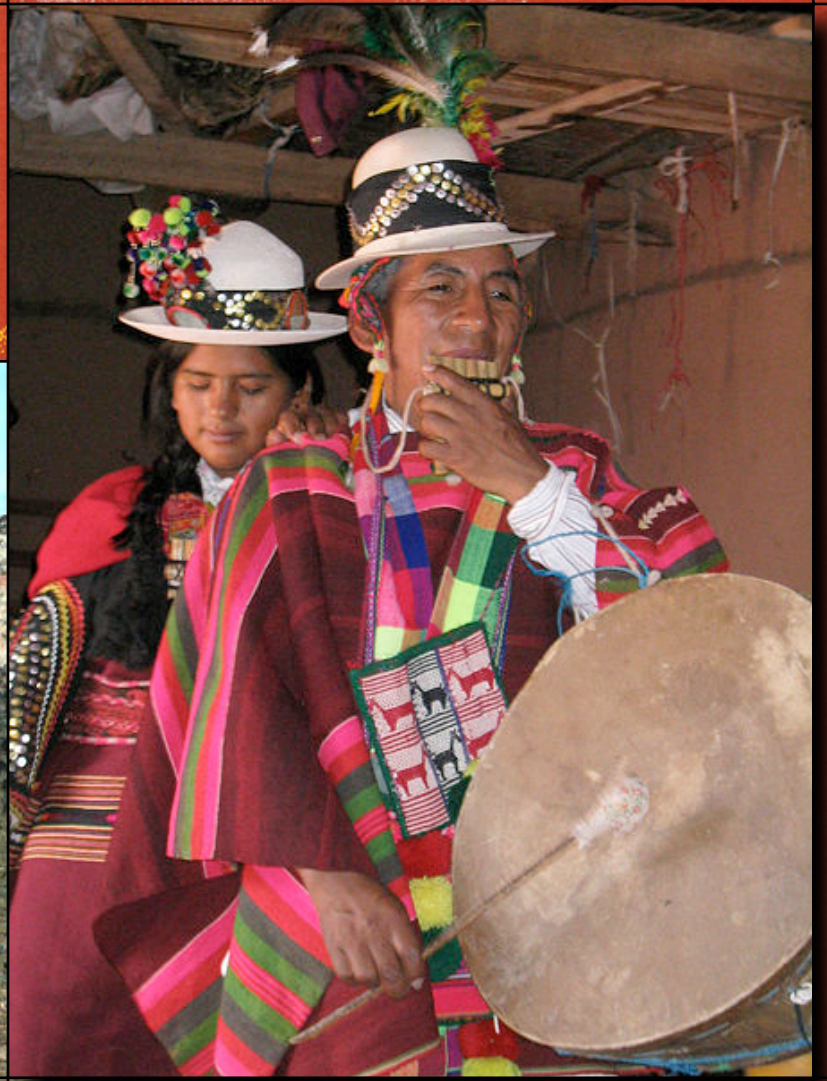
AYMARA MUSICIANS WITH SIKU (PANFLUTE) AND CAJA (DRUM)