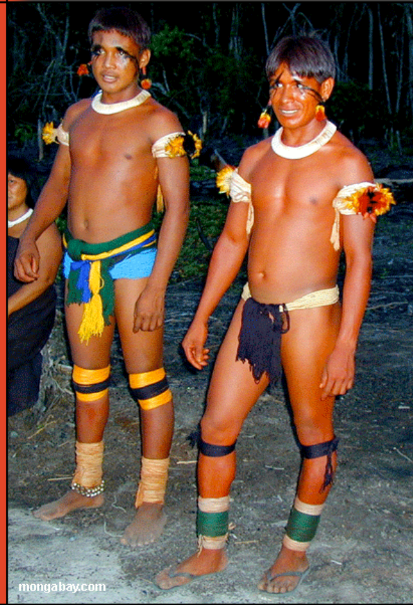
KAYAPO NATIVES IN THE BRAZILIAN AMAZON