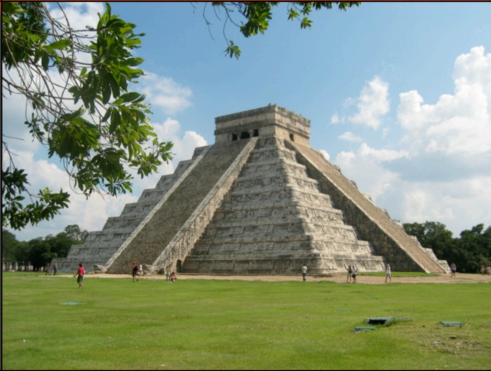
CHICHEN ITZA, MEXICO